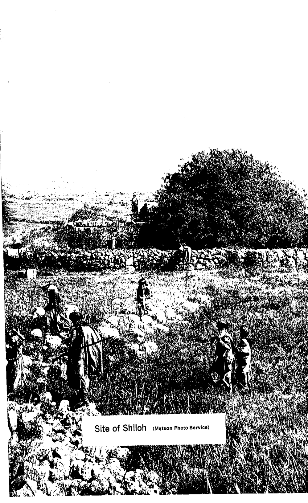
Site of Shiloh