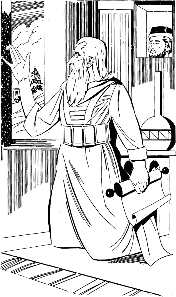
Nevertheless Daniel Prayed