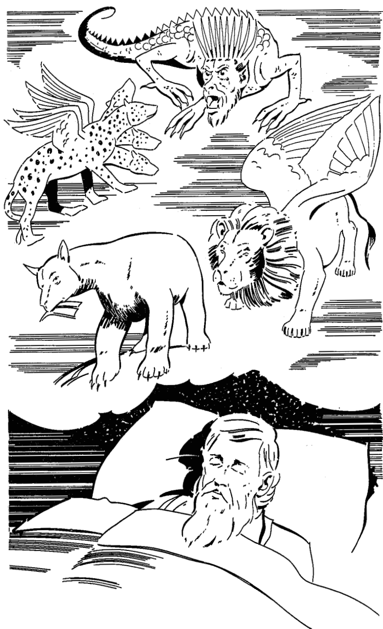
The Four Symbolic Beasts